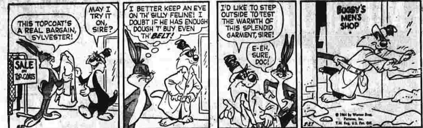
BOSSY'S MENS SHOP